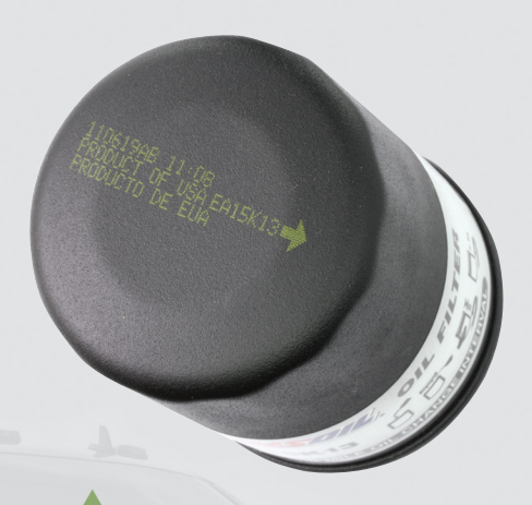
AMSOIL Oil Filters feature a reference arrow to aid in proper installation. Once the filter is finger tight, it is easy to gauge the additional three-fourths to 1.25 turns required to ensure a good fit. Over-tightening can lead to leakage.