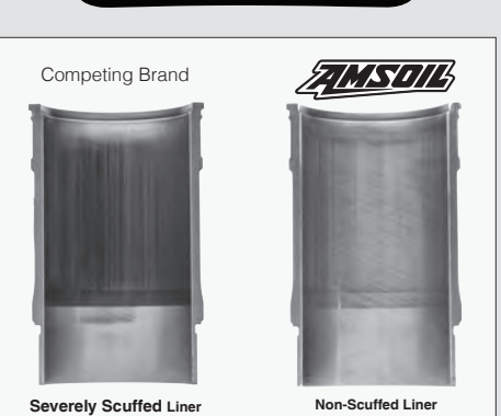
Detroit Diesel DD13 Scuffing Test for Specification DFS 93K222