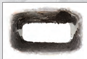
SABER Professional @ 100:1 4% Airflow Loss