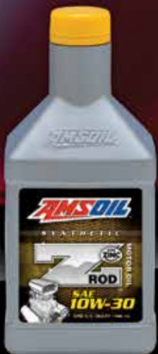
SYNTHETIC MOTOR OIL