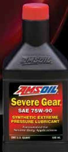
SYNTHETIC GEAR LUBE